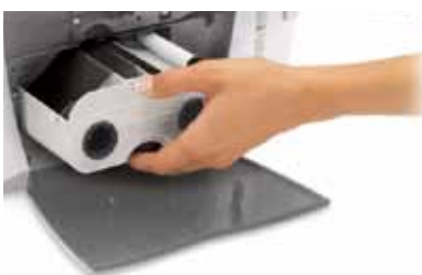
Load ribbons in a snap. The Persona's all-in-one printer cartridge lets you change both the ribbon and cleaning roller in one easy step.

Security begins with the card. Protect your photo ID and access cards from counterfeiting with HID visual security solutions. Custom HoloMark™ cards (top) embed a 3D holographic design onto the card surface. Translucent foil cards (above) embed a holographic watermark just under the card surface. These and other visual security solutions make the ID cards produced by your Persona C30e hard to forge or alter, yet easy to authenticate.