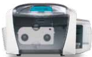
Persona C30e single-sided printer

The versatility of the Persona C30e also extends to card stocks. It can print on cards as thin as 9 mil and as thick as 40 mil. That includes the new thin ID cards all the way up to thicker smart cards with embedded electronics. Thin plastic cards are quickly gaining popularity around the world for health care, mass transit systems, highway tolls, parking, membership and customer loyalty programs. Because the cards are thin, flexible and lightweight, they're easy to mail, attach to a patient's chart or slip into a