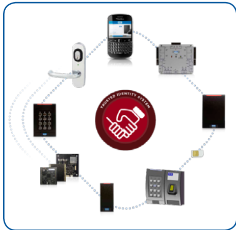
iCLASS SE® Platform